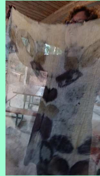
Diane Lundberg teaches eco-dying on silk scarves