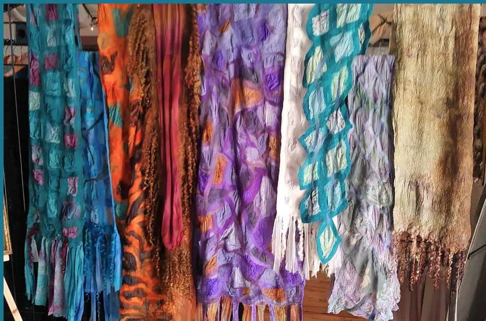
nuno felted scarves by Patti Barker